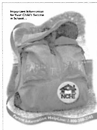
Parent Pack Pocket Folder